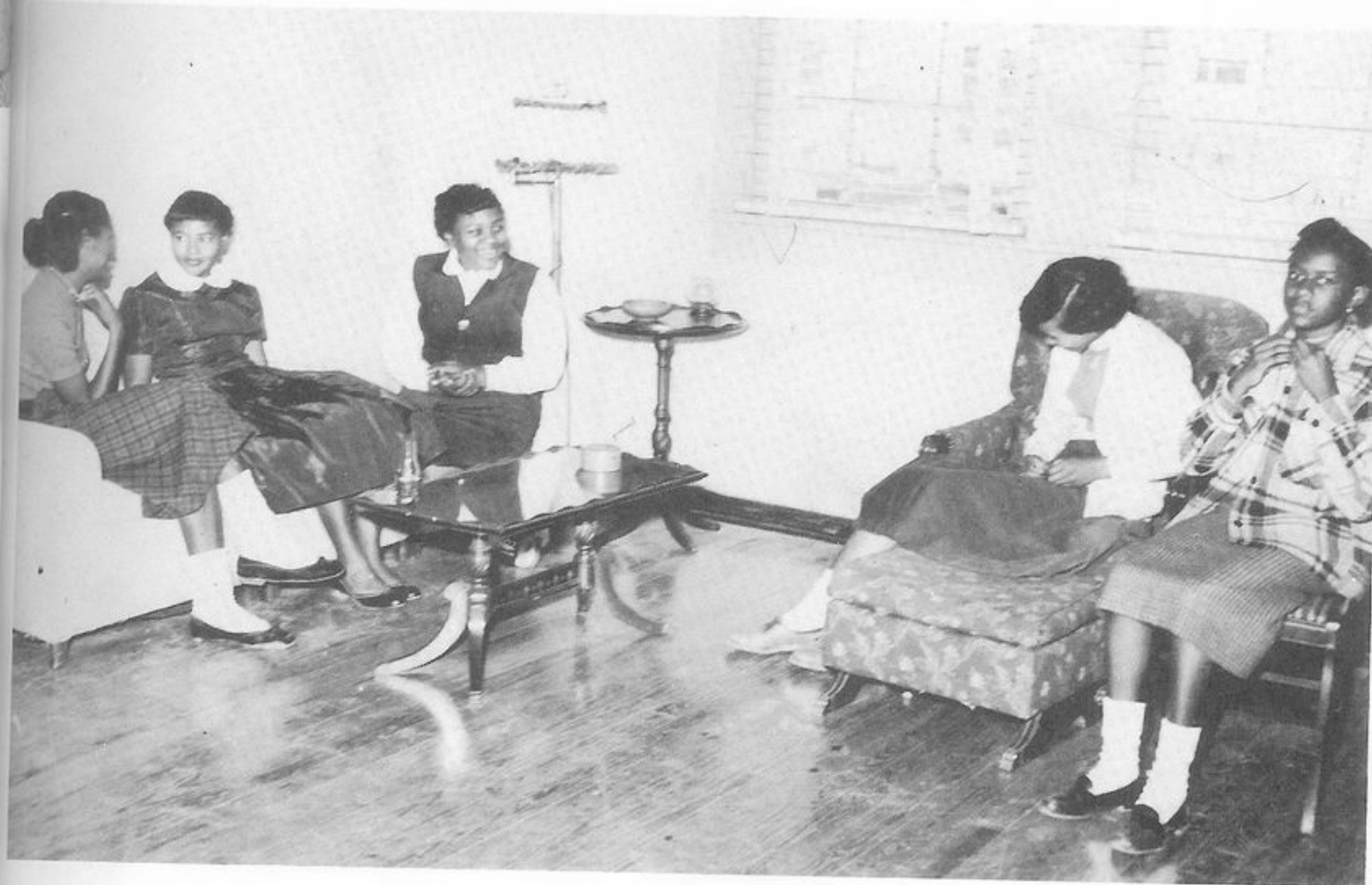
Home Economic class at work A group of girls entertaining in the living room.